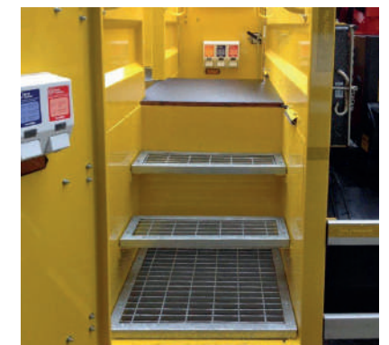
Low entry non slip access steps to body with lighting and full height lockable door.