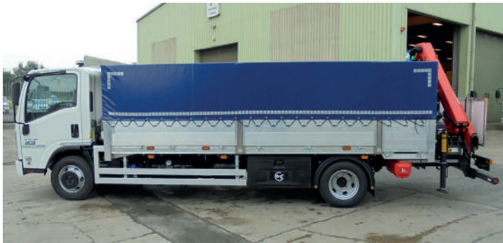
Dropside with tarp cover

These are just a few of the many body styles and finishes available from T H WHITE.