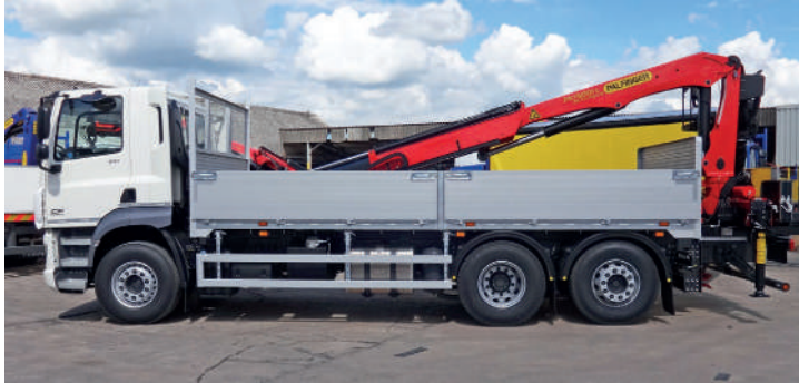
Alloy Dropside with choice of locks