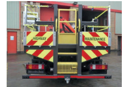
Stepped and gated rear access on a pole erection, street lighting vehicle.