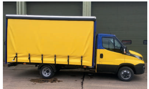
Curtain-sider small truck

So, if you are considering a new bespoke vehicle built to the highest standards at a competitive price, talk to T H WHITE today. You might be surprised at just what we can do for you.