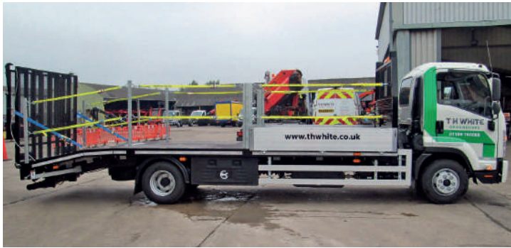
Beaver Tail on small to medium size chassis