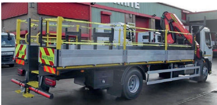
Street lighting with bolsters and rear access