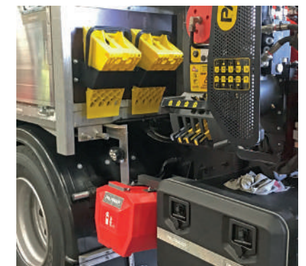
Storage options include extinguisher, chocks and tool boxes.