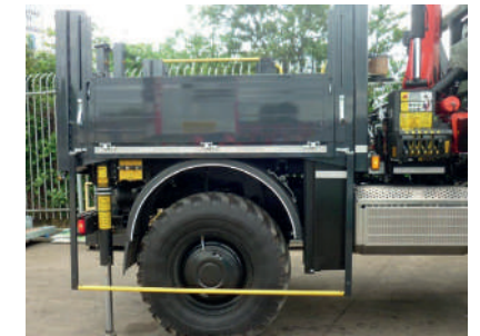
Fall prevention rail, independent of dropside.